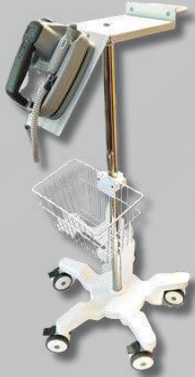
Roll Stand (STND-150)